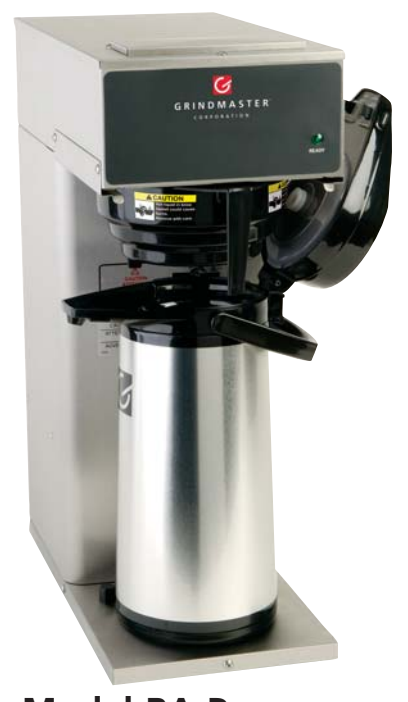
Model BA-P (Airpot sold separately)